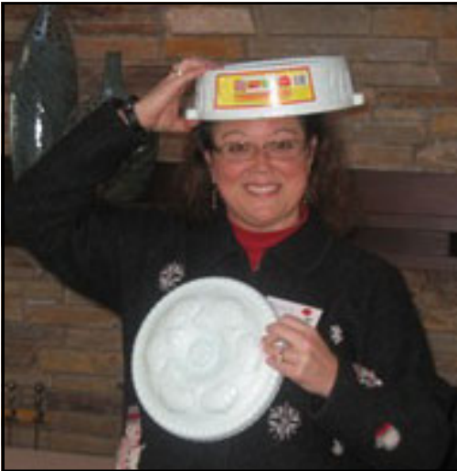
Alpha Chapter Auctioneer taking bids for this tortilla warmer...SOLD!

ALPHA CHAPTER jumped into the swing of Christmas this year with traditional caroling melodies, the smell of freshly baked cookies, and shining, blinking holiday lights. This year, our annual chapter Christmas auction proved to be a very successful event netting $291.45.