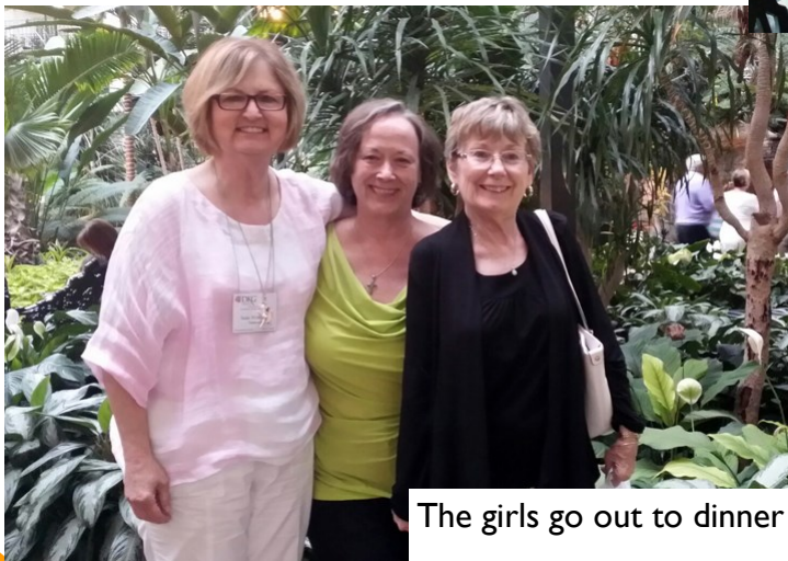
The girls go out to dinner