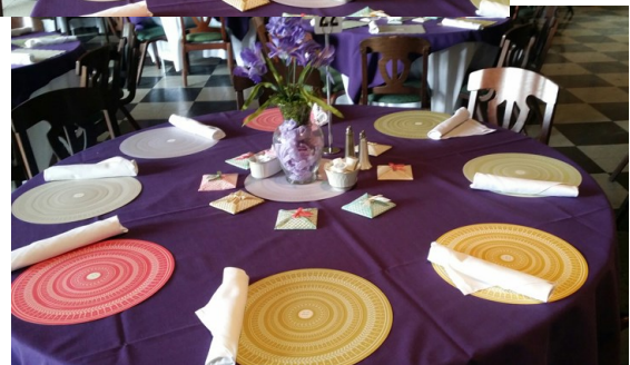
Our own Susie Westbrook did the decorations for several of the events at the convention. This is only one example!