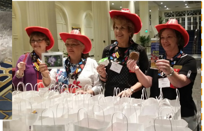
Check out what 2,000 Goodie Bags look like!