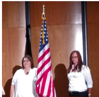
Cami presents the United States flag at the opening ceremony