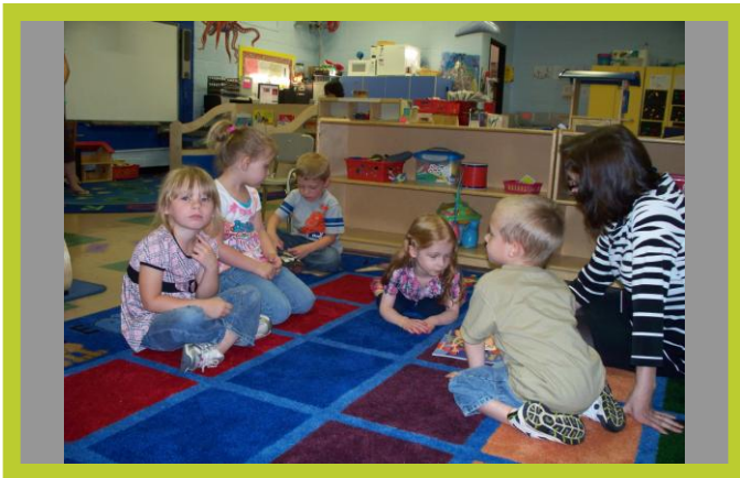
2011 Pre-K and Kindergarten Orientation at Red Boiling Springs Elementary School (Info for 2012 Pre-K and Kindergarten Orientation on Page 3)