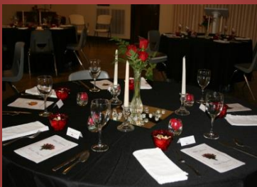
Founder's Day 2014

Xi State Convention June 4- 6, 2015 Sewanee, TN