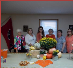
New Teacher Reception held at the Macon County Board of Education by Alpha Gamma Chapter.