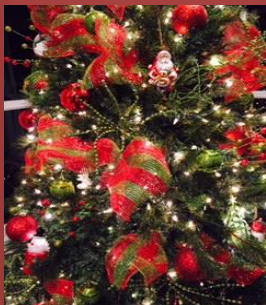
January 5 th , 2016