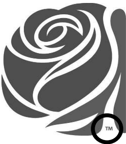
This LOGO is a copyrighted and “Trade Marked” design from International with restricted uses. (See the TM in the circle)