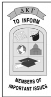
This graphic is from the DKG Graphics CD.