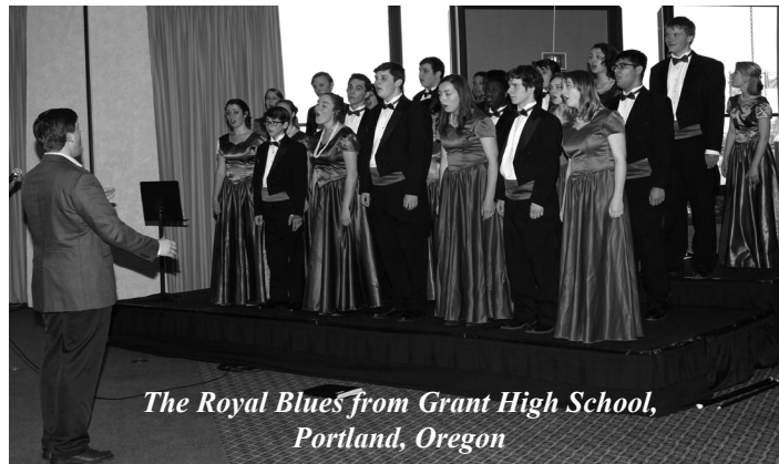
The Royal Blues from Grant High School, Portland, Oregon