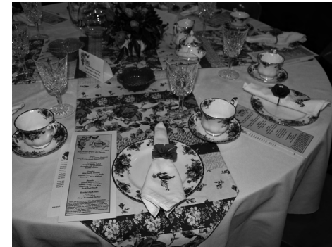
Lovely tea table (above) and yummys (below) show off the Beta Beta ambience.

Beta Beta (Tigard & Sherwood): earned almost $3,000 for its Education Foundation at the May Spring Tea. We are currently applying for 501(c)(3) status.