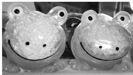
"Sticky" Frogs for Alice