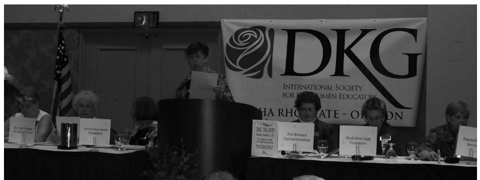
General Business Session