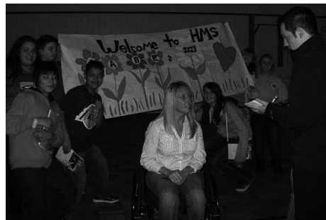
Hamlin Middle School participants