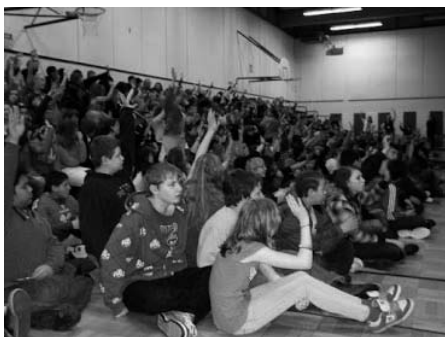
An attentive audience asks questions