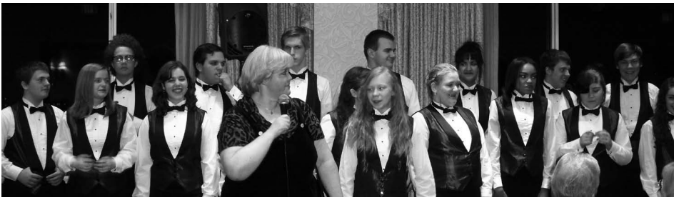
Sheldon High School Dublinaires Performed Saturday evening.