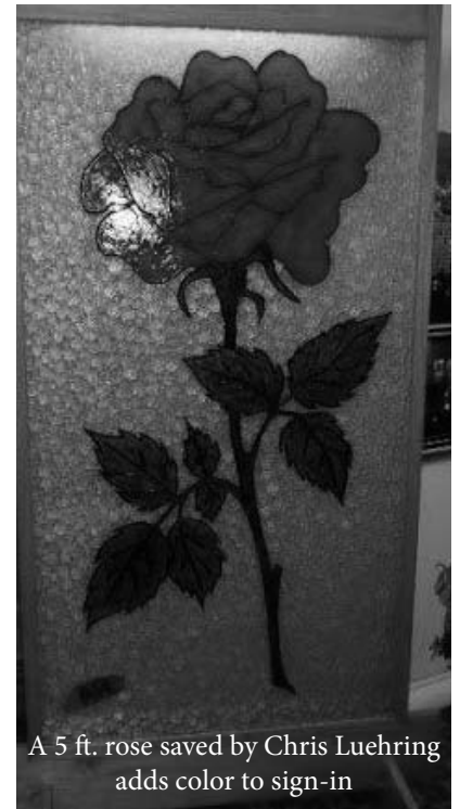
A 5 ft. rose saved by Chris Luehring adds color to sign-in