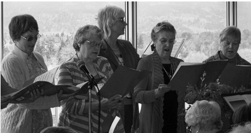
Alpha Rhosies 2012