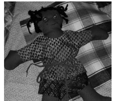
A doll of color for children in Africa