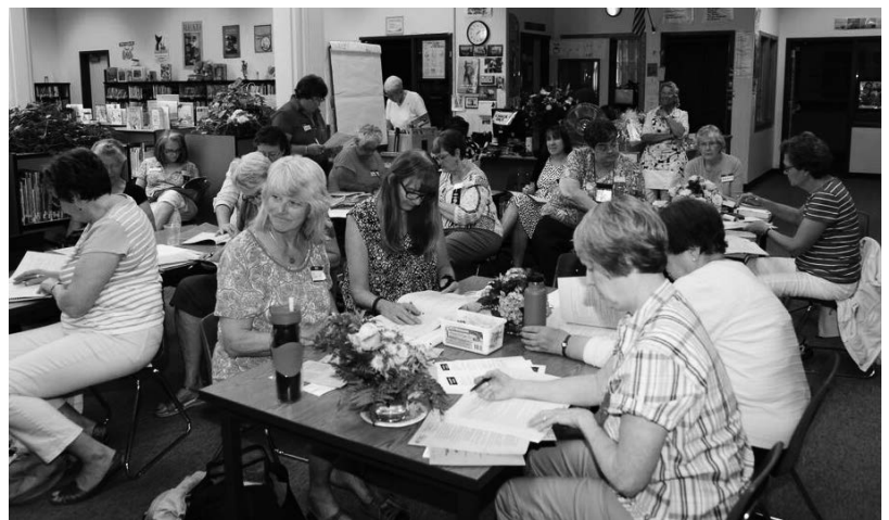
Executive Board in Session