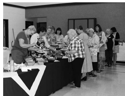
Lunchtime Line OSU Food Service did well by us.