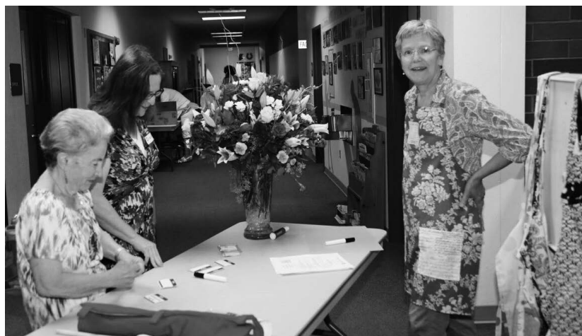
Our host chapter, Kappa, staffing the registration table. Note the lovely bouquet (later raffled off) and the wonderful aprons on the rack, with one "displayed" by a Kappa member.

International Convention July 5 - 9, 2016 Nashville, Tennessee