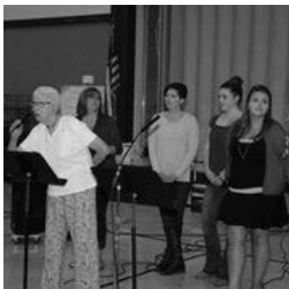
Luncheon Entertainers (They were good!)