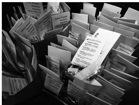
80 Gamma New Teacher Bags

Gamma (Lane Co.): In August Gamma Chapter delivered 12 books to each of the Eugene Pearl Buck graduating preschoolers as they prepare for kindergarten in the fall. Proceeds from our yard sale were donated to Camas Country for educational field trips where students learn how grains are