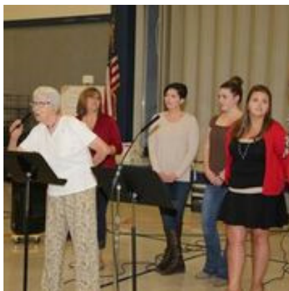
Luncheon Entertainers (They were good!)

Fall Conference, home from her trip to Botswana