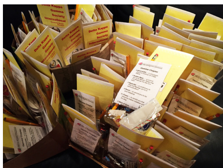
80 Gamma New Teacher Bags

Gamma (Lane Co.): In August Gamma Chapter delivered 12 books to each of the Eugene Pearl Buck graduating preschoolers as they prepare for kindergarten in the fall. Proceeds from our yard sale were donated to Camas Country for educational field trips where students learn how grains are