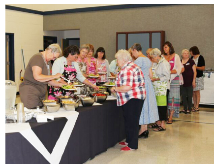
Lunchtime Line OSU Food Service did well by us.