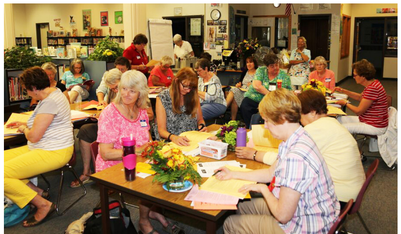
Executive Board in Session