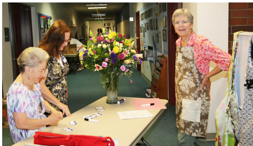
Our host chapter, Kappa, staffing the registration table. Note the lovely bouquet (later raffled off) and the wonderful aprons on the rack, with one "displayed" by a Kappa member.

International Convention July 5 - 9, 2016 Nashville, Tennessee