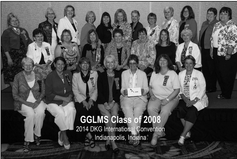
GGLMS Class of 2008 2014 DKG International Convention Indianapolis, Indiana