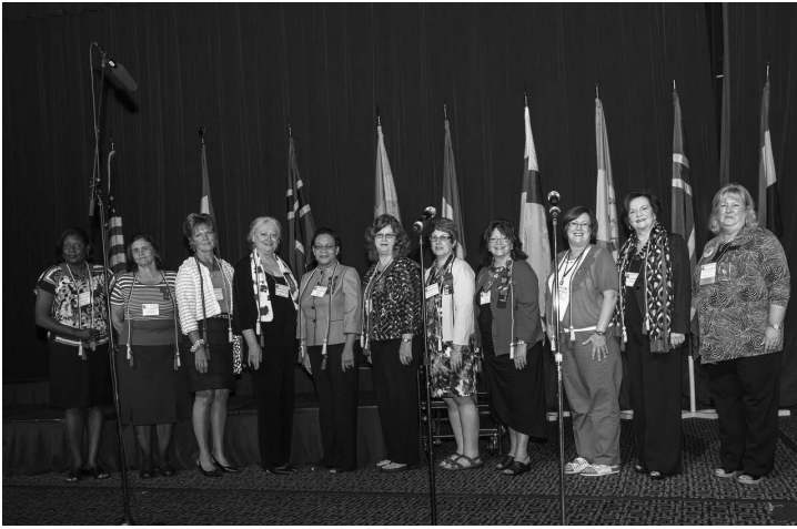
Flag Ceremony