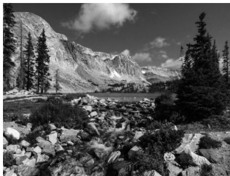
The Snowy Range and Marie Lake