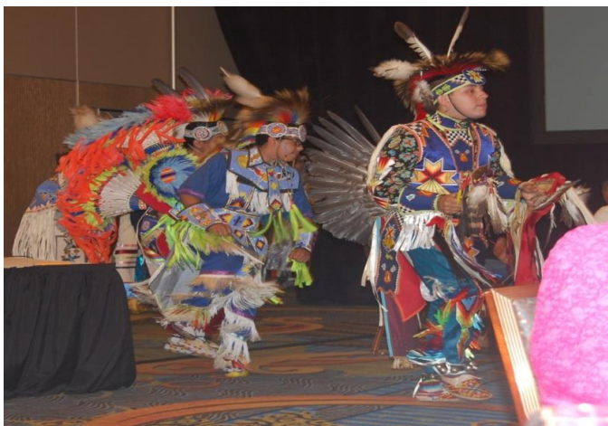
Mashantucket Pequot Nation Inter-tribal song and dance.

During this conference, NH participated in its first vendor fair at an international conference. We were successful in this endeavor raising $550.00. After expenses for the table space ($75.00), card printing ($98.00), and credit card processing ($7.49), we made a net profit of $369.51 for the state treasury. We have 57 packages of are cards remaining and when those are all sold we will be able to add $285.00 to the profit column.