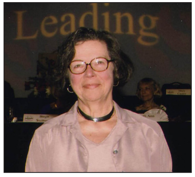
President Flora Sapsin's picture was taken by Photographs by Jim.