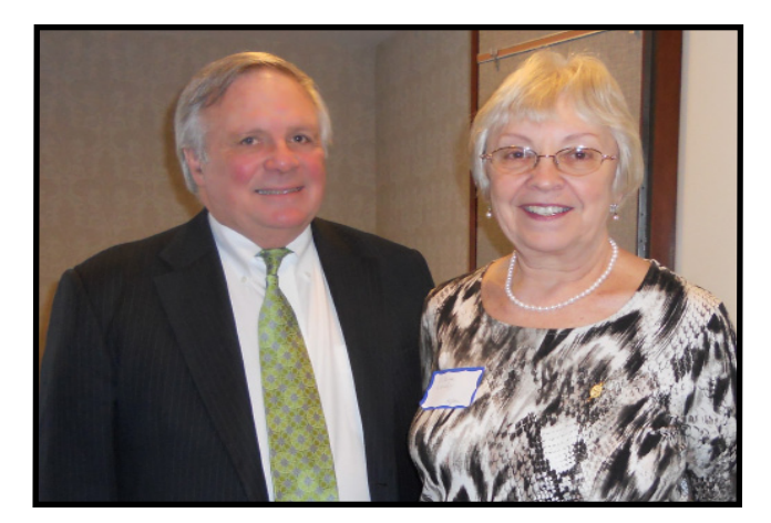
BAS SPRING CONFERENCE PHOTOS

House Bill 1483: (Chapter 261, Laws of 2012) This bill repeals the NHRS Special Account and removes all references to the Special Account contained in RSA 100-A. Due to previous legislation enacted in 2011, the Special Account balance would have been $0 as of July 1, 2012. This bill also repeals the employer "spiking" assessment (RSA 100-A:16, III-a). This assessment had been scheduled to take effect July 1, 2012.