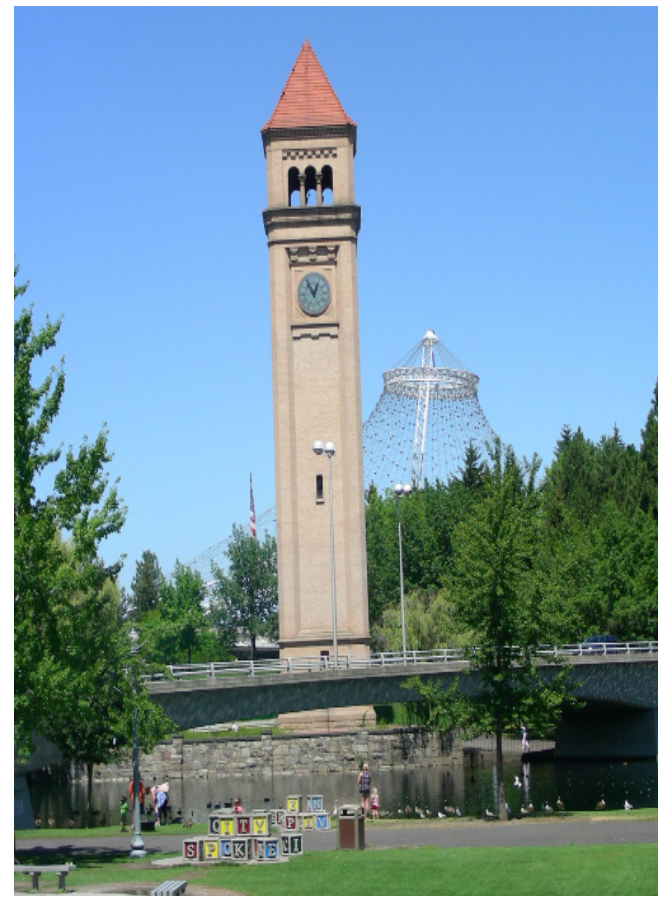
Spokane is a beautiful and walkable city, says Barbara.

Add to that fellowship, friendship, "Visions to Action," great workshops, great speakers and a very walkable city area. Over 1400 key women educators gathered to celebrate, learn, sightsee, and grow professionally and personally. It has often been said that the chapters ARE the key to DKG. They are, no doubt about it, but once you experience a regional conference and/or an international convention, you suddenly see the "big picture."