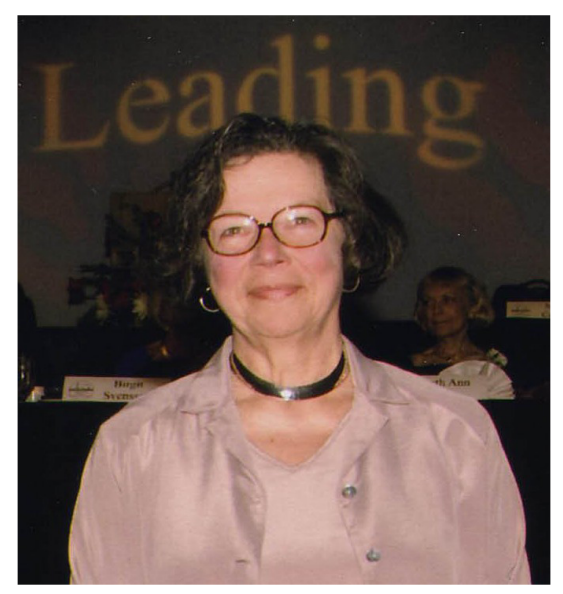
Photographs by Jim, 2008

Welcome to "almost fall," that very special time of year when the entire world longs to be in beautiful New England where we reap the reward for suffering through three other seasons!