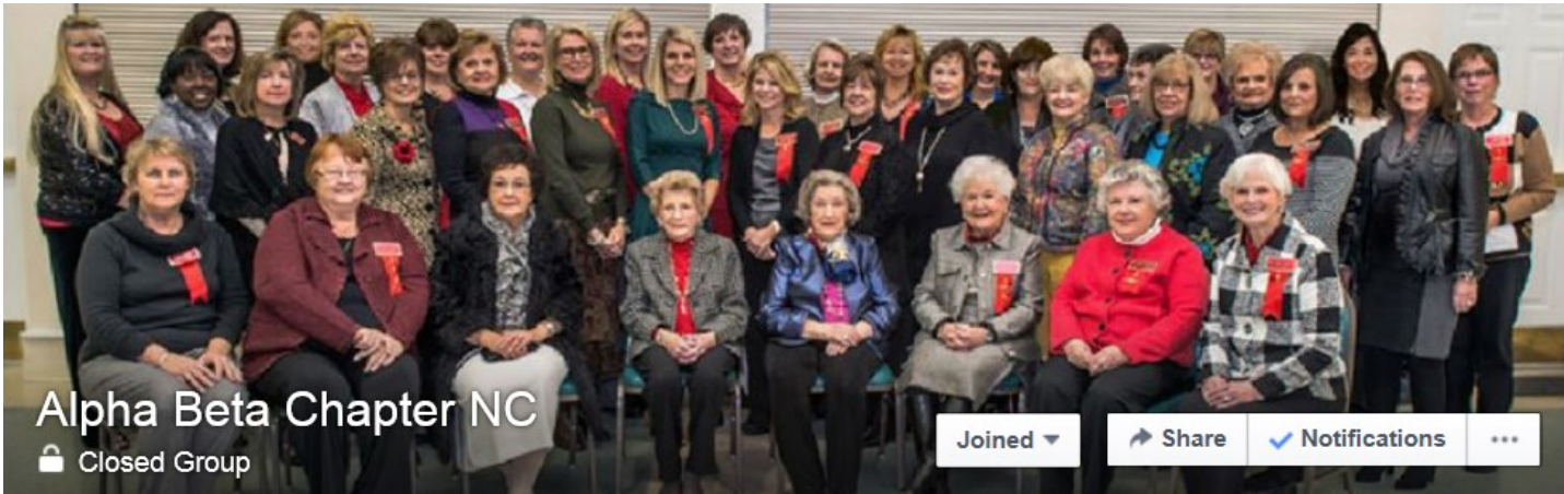
Alpha Beta Chapter NC Closed Group