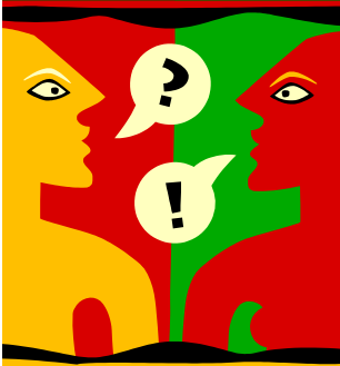
Find Name of Mystery Member on Page 5 .