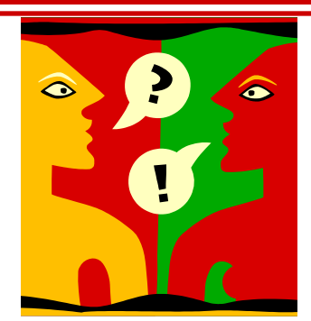
Find Name of Mystery Member on Page 7.