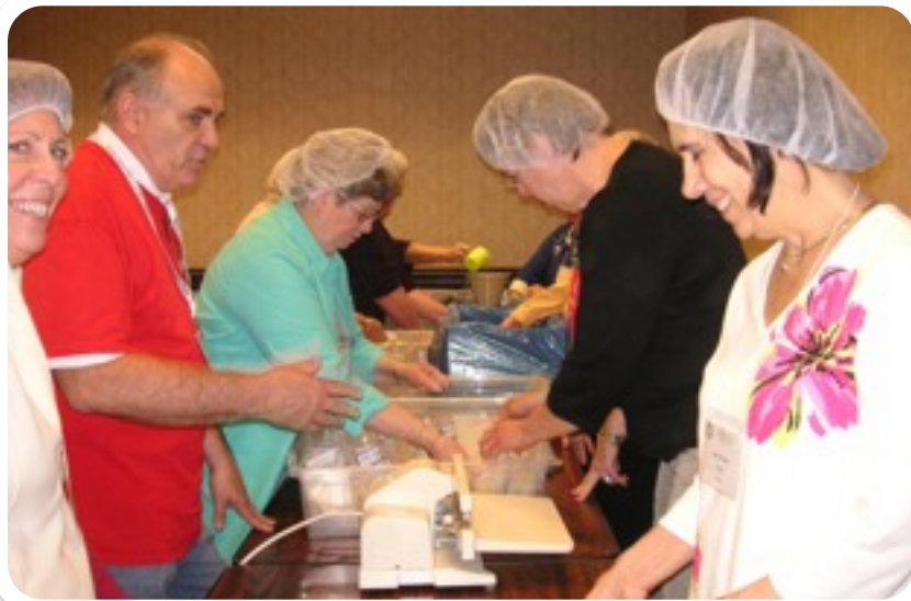
Members help package foods for Kids Against Hunger program.