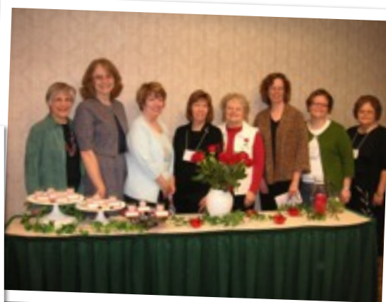
Ceremony of Remembrance performed by Alpha Rho Chapter members.