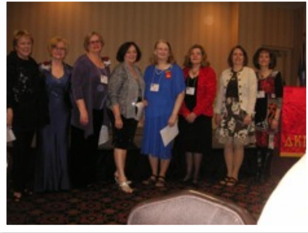
Women of Achievement 2012 and 2013 were honored. (See page 3 for names of awardees.)