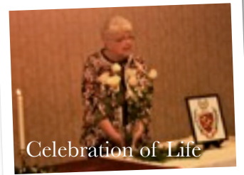
Celebration of Life