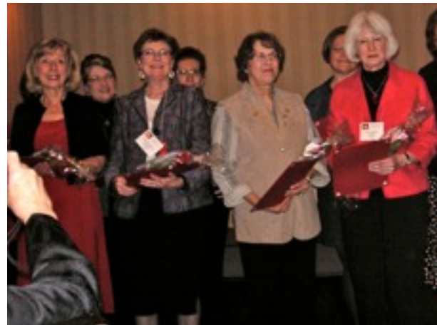
Chapters Kappa and Delta welcomed members to attend the Tau State conference in Duluth on April 25-27, 2014 at the Holiday Inn.