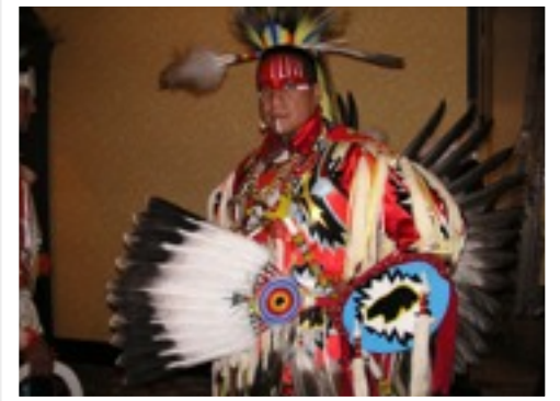
First Nation Dancer performs at Edmonton Night.