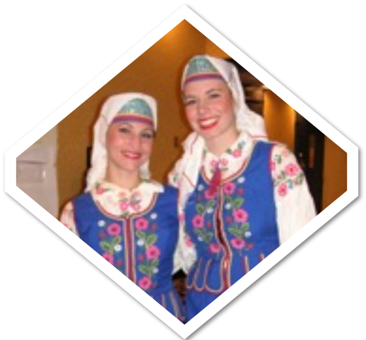
Ukrainian dancers prepare to perform their cultural presentation during Edmonton night at NW Regional Conference.