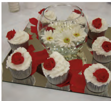
Every birthday celebration calls for cake!