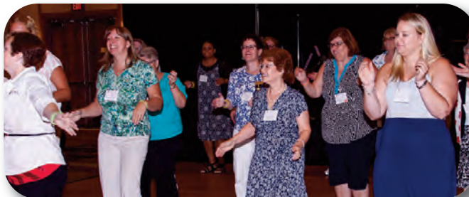
Can you spot the Kappa members dancing with other first-timers at the NER?