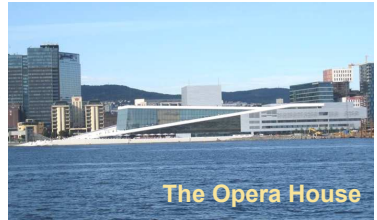
The Opera House

It was a beautiful evening, however, and first we motored to see the Opera House in her full marble glory. Then seawards past historic sites, new towns and holiday beaches. Only photographs can possibly do justice to the scenery and I include a couple here to give a flavour for those who were not there to see it for themselves.