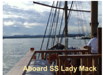
Aboard SS Lady Mack

with many old friends from previous conferences, as well as enjoying the company of our own GB members.