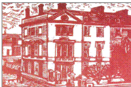
A picture of the library building from the Programme of the Association of Independent Libraries Annual Meeting in 2010

We have learned to be proud of our quirky, original features and to adapt to current needs. We now have a Writers' Circle, Book Group and regular literary lectures and are constantly seeking out new ways of promoting our unique and cherished product.