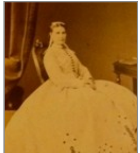
Florence Baker 1841-1916

As we went round, an amazing variety of ideas came into my head especially from the women's perspective. I was incredibly drawn to a photograph of Florence Baker, who was purchased at a slave auction in Turkey by Samuel Baker White. (it made me wonder about some of the 'fellas' of the Society!). They married and she accompanied him on his quest to discover the source of the Nile. I wonder if she was happy, and what part she played in supporting his scientific ideas.