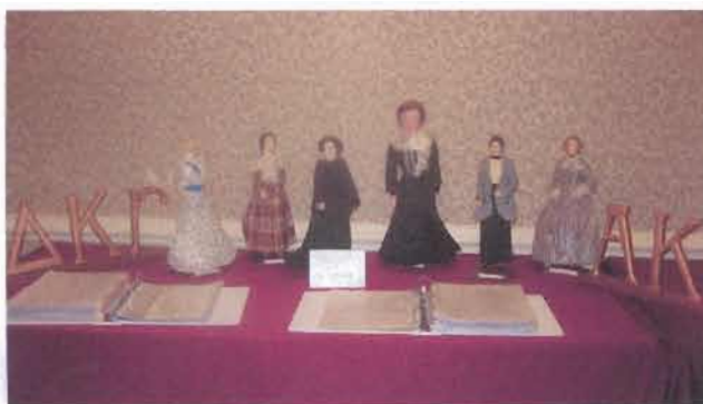
Alpha Kappa State Display Connecticut Pioneer Women and State History Books