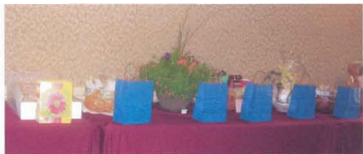
Chapter Donations for State Fundraiser