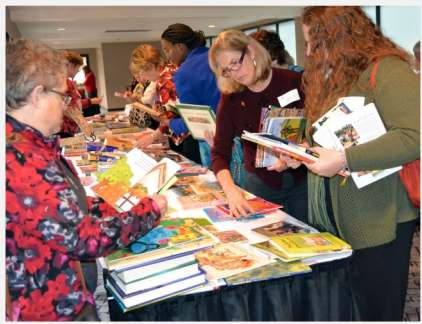
Ad Hoc Birthday Committee Fundraiser for Curriculum of Hope