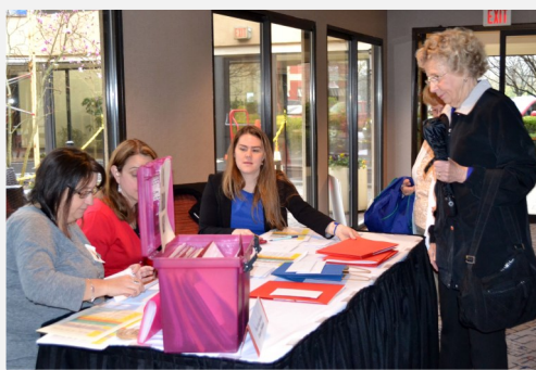
Registration Table (Epsilon Chapter)