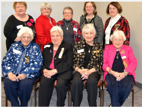
Alpha Kappa State Past State Presidents