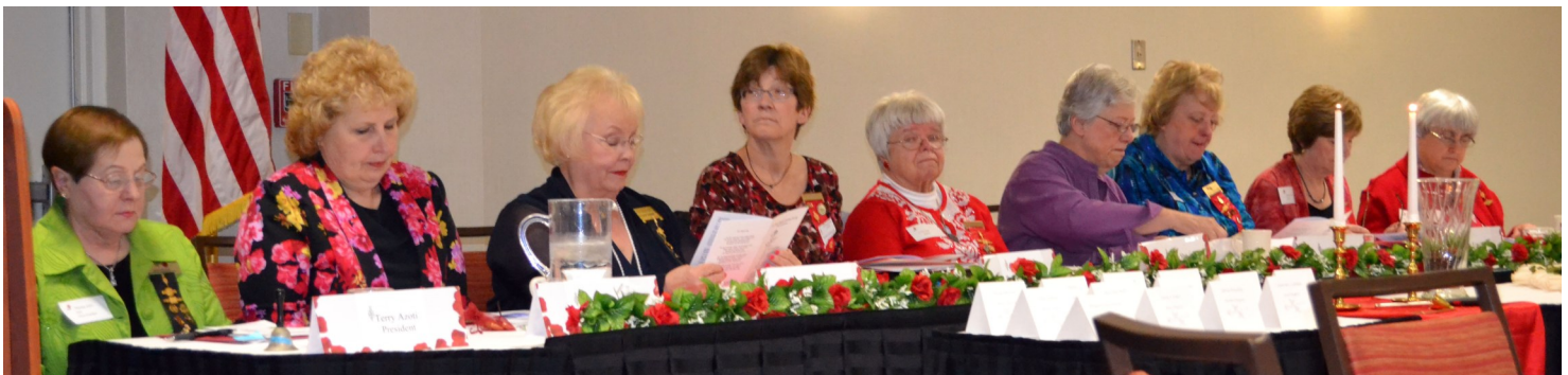
Head Table at Spring Convention, Solemn during Ceremony of Life