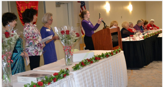
Ceremony of Life (Delta Chapter)