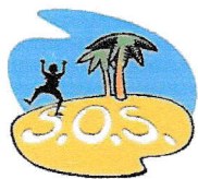
Figure it out

Remember to bring your toiletry supplies to put in the "help others" basket. The items will be delivered to the Against Abuse Program and if any are needed by the foreign exchange students they can be shared with them.