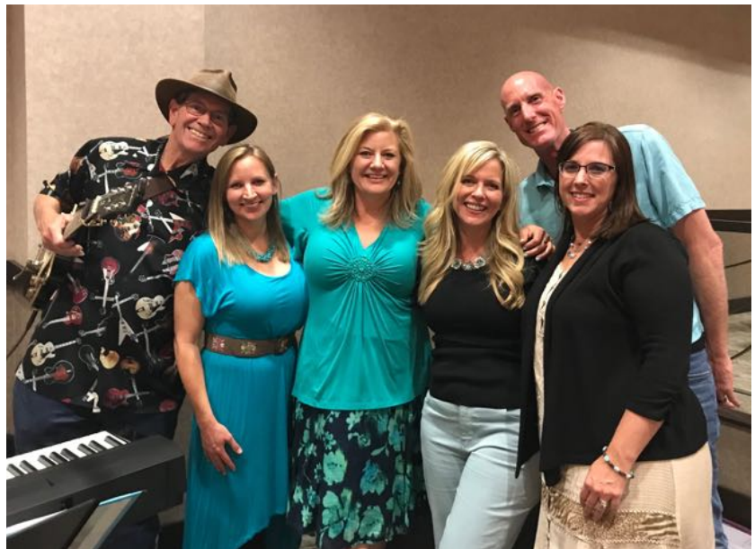
Two of the ladies are school teachers, one is a nurse and one is an insurance agent.