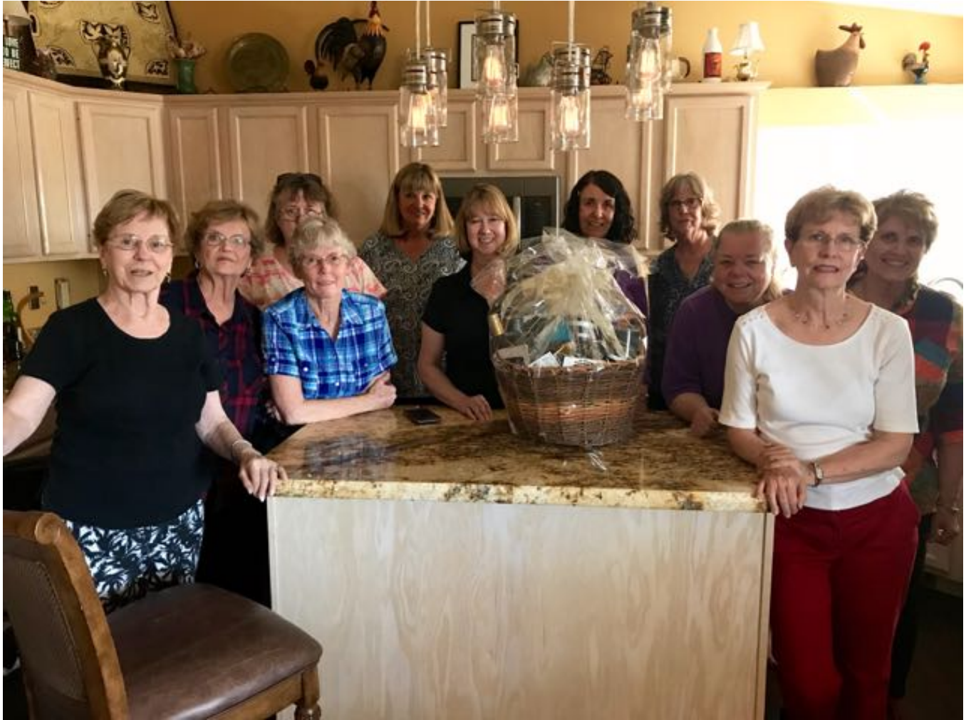
TWELVE MEMBERS POSE AT THE “PACKING PARTY” WHERE THEY PREPARED FOLDERS AND BAGS FOR CONVENTION AS WELL AS ASSEMBLING THE ETA CHAPTER “YEE HA” RAFFLE BASKET