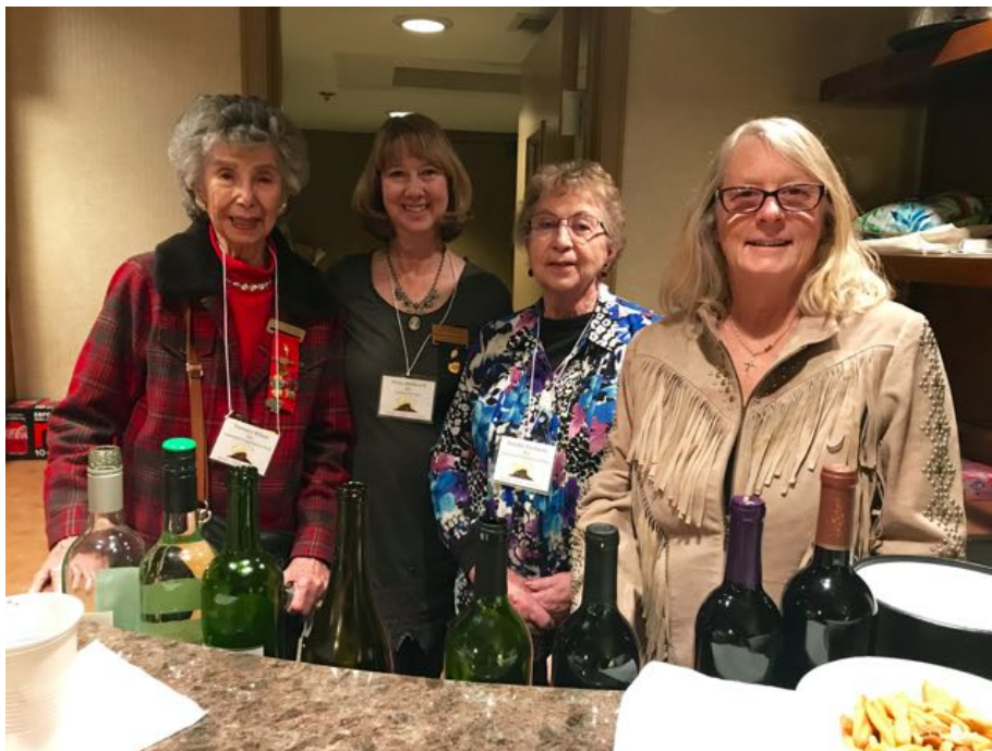
Hospitality Room Workers!