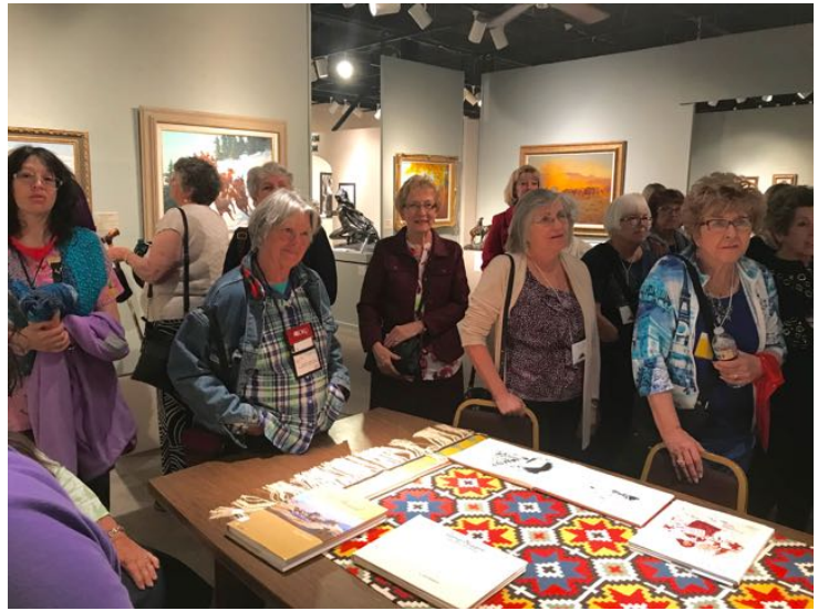
DKG Members visit the Phippen Museum on tour.