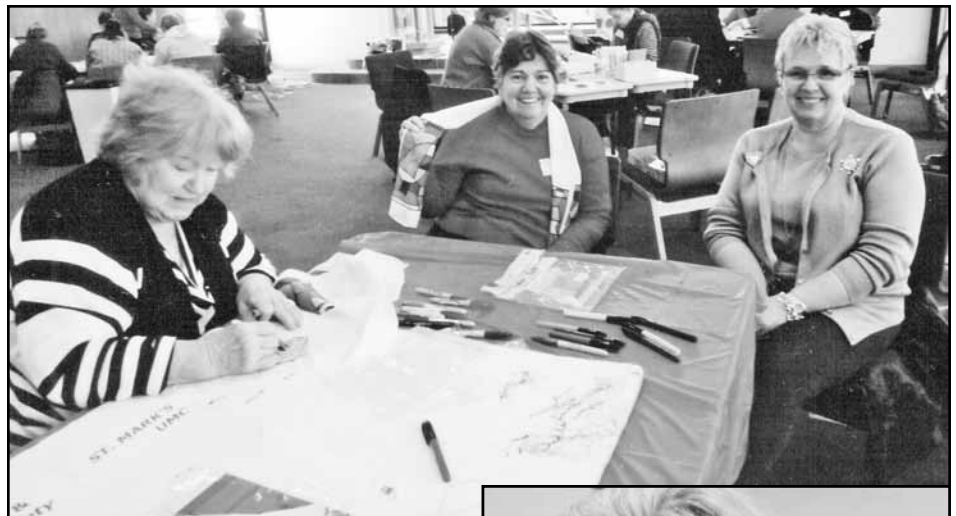
The tables were full at the Arts Retreat