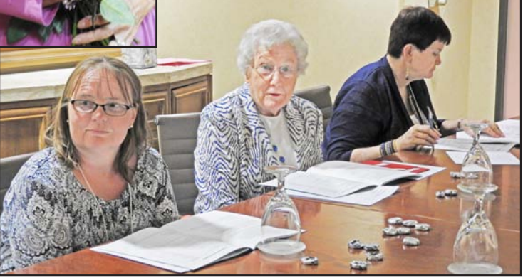
There's a lot going on at this workshop.