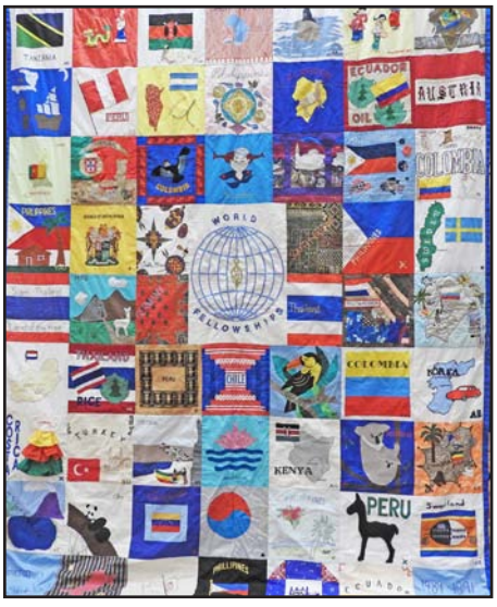
The 1989-91 World Fellowship Ouilt was displayed at the 2016 Omicron State Convention.