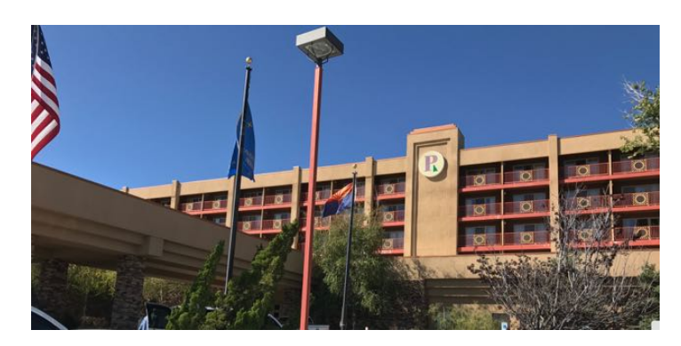
Front view of The Prescott Resort