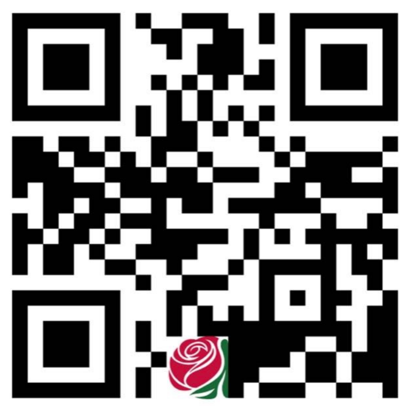
Scanning this QR code will link to the International website.