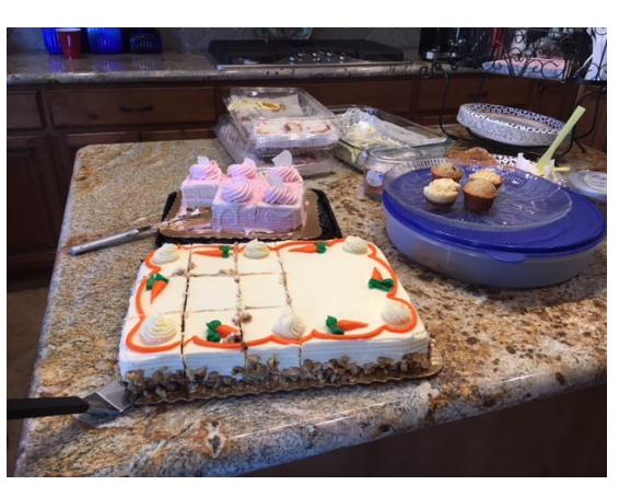
Yummy cake and desserts!