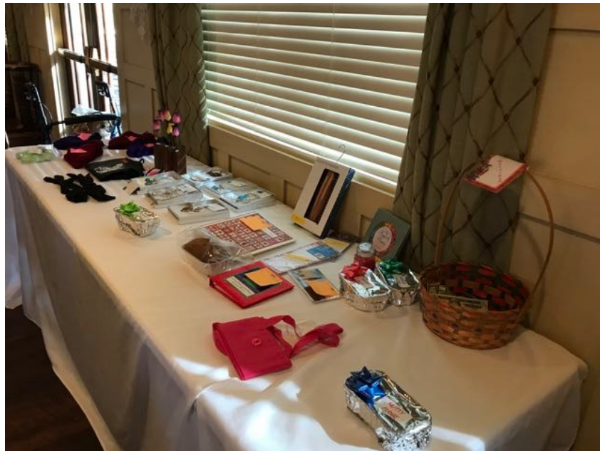
Eta Chapter's Christmas Boutique 2017